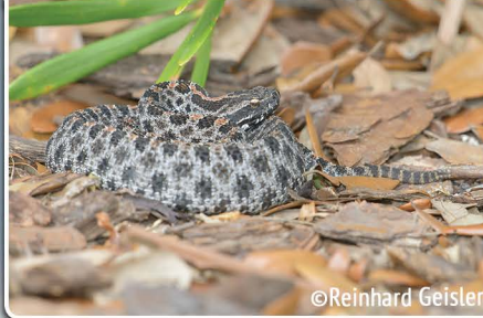
Snake ↓ Pygmy Rattlesnake