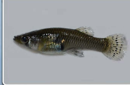
Minnow ↓ Mosquito Fish