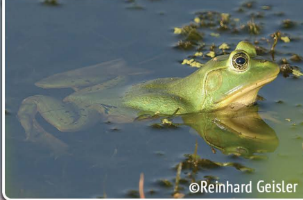
Frog ↓ Pig Frog