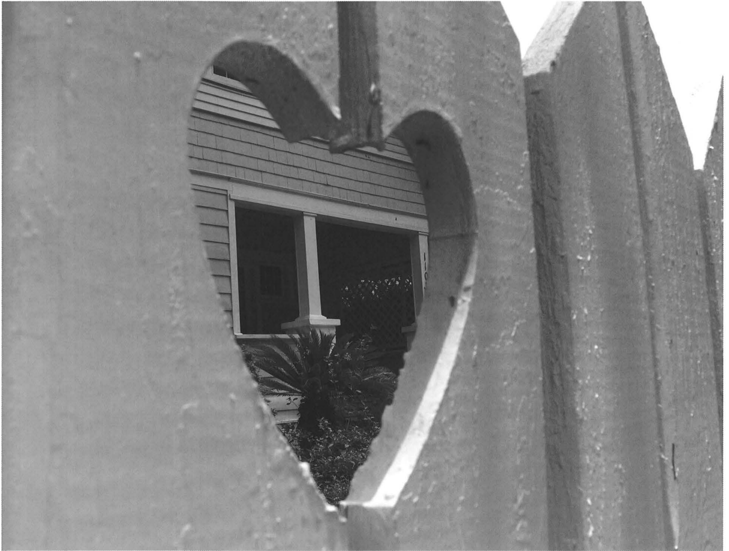
1103 East Washington Street • Circa 1925 • Photo by Giannina Rodriguez

The bungalow at 1103 East Washington Street was built circa 1925.