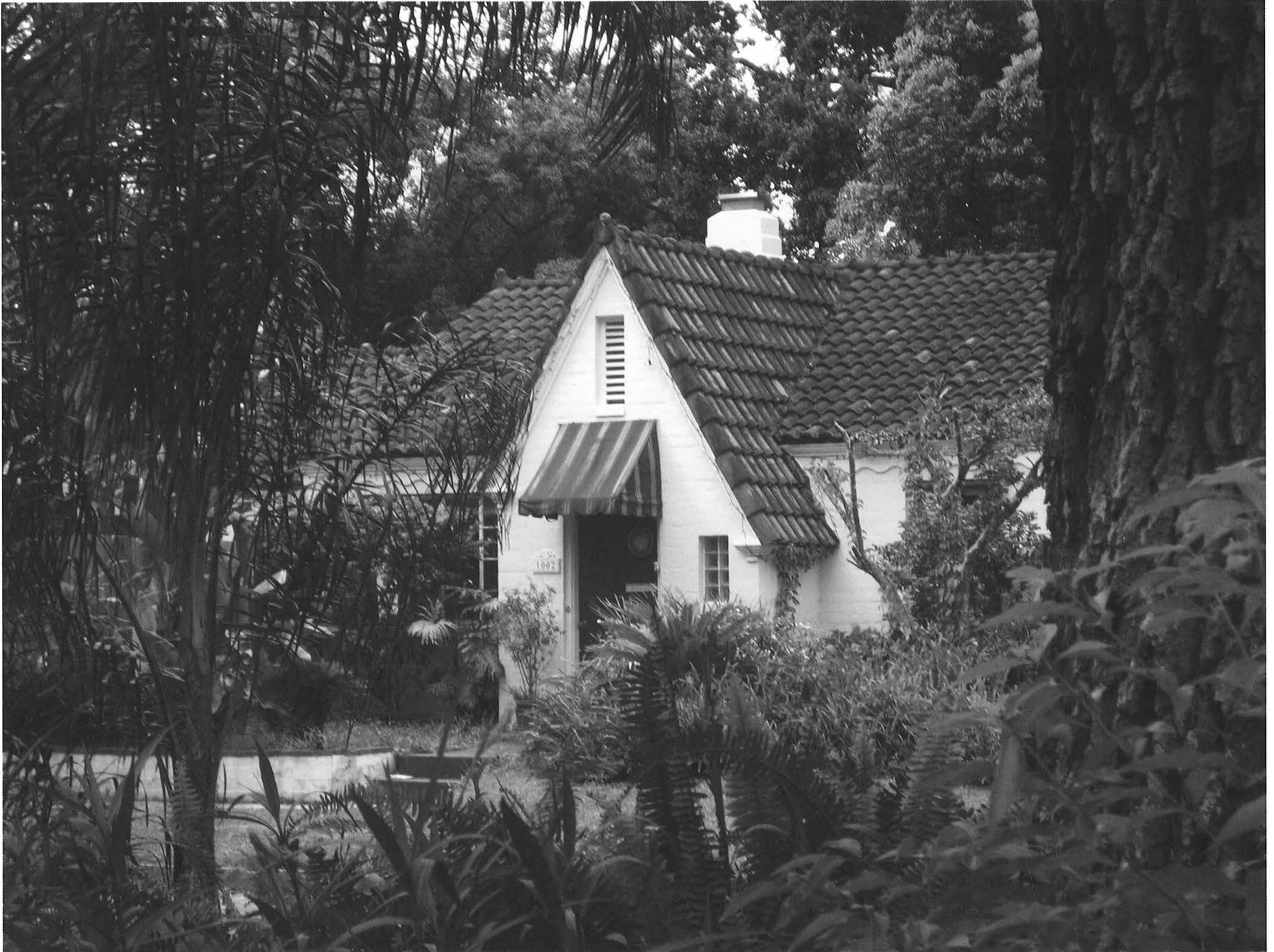
1002 East Jackson Street • Circa 1940

The Tudor Revival residence at 1002 East Jackson Street was built circa 1940.