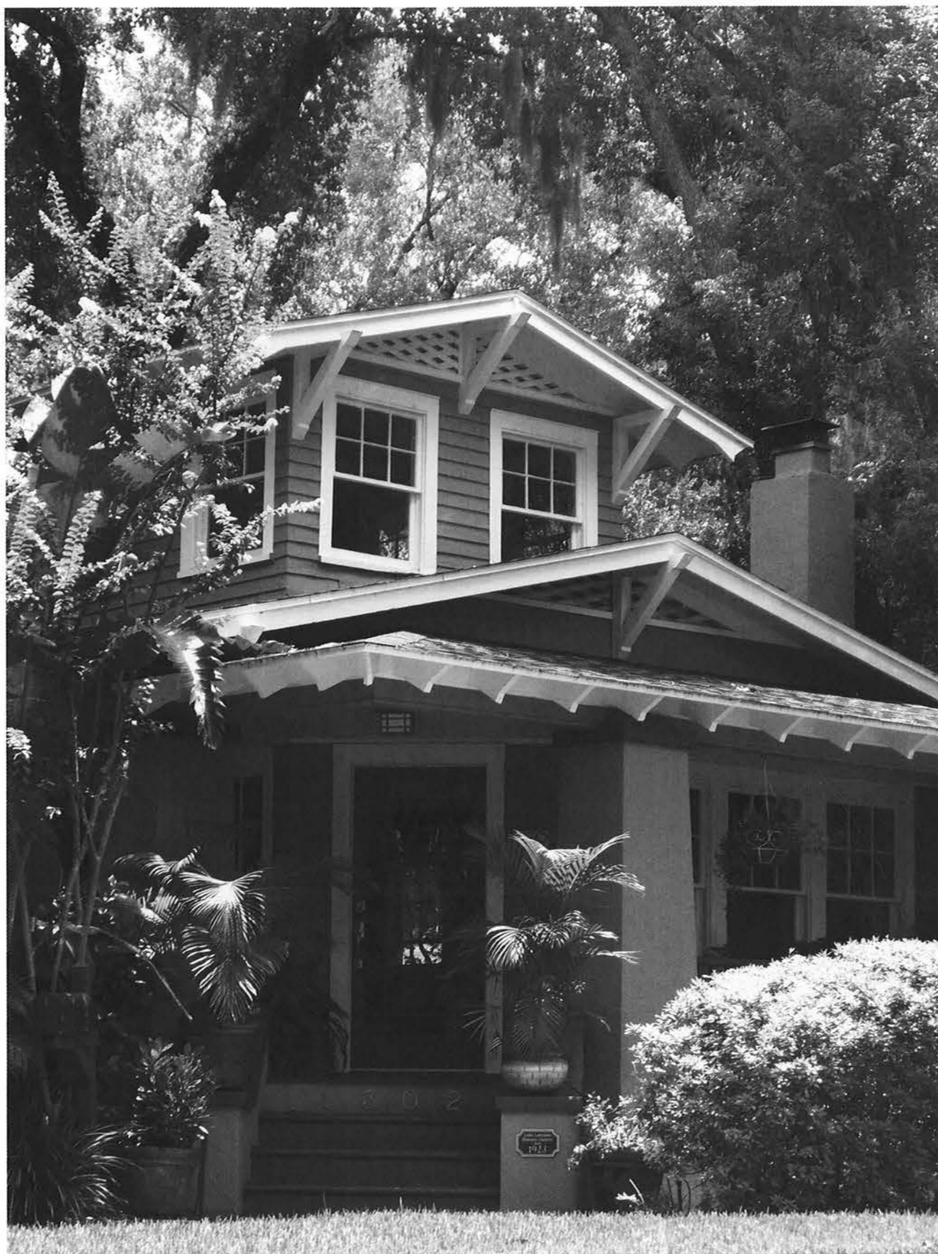
1302 East Central Boulevard • Circa 1923

The one and one half-story Craftsman style bungalow at 1302 East Central Boulevard was built circa 1920 and has an unusual angled entry.