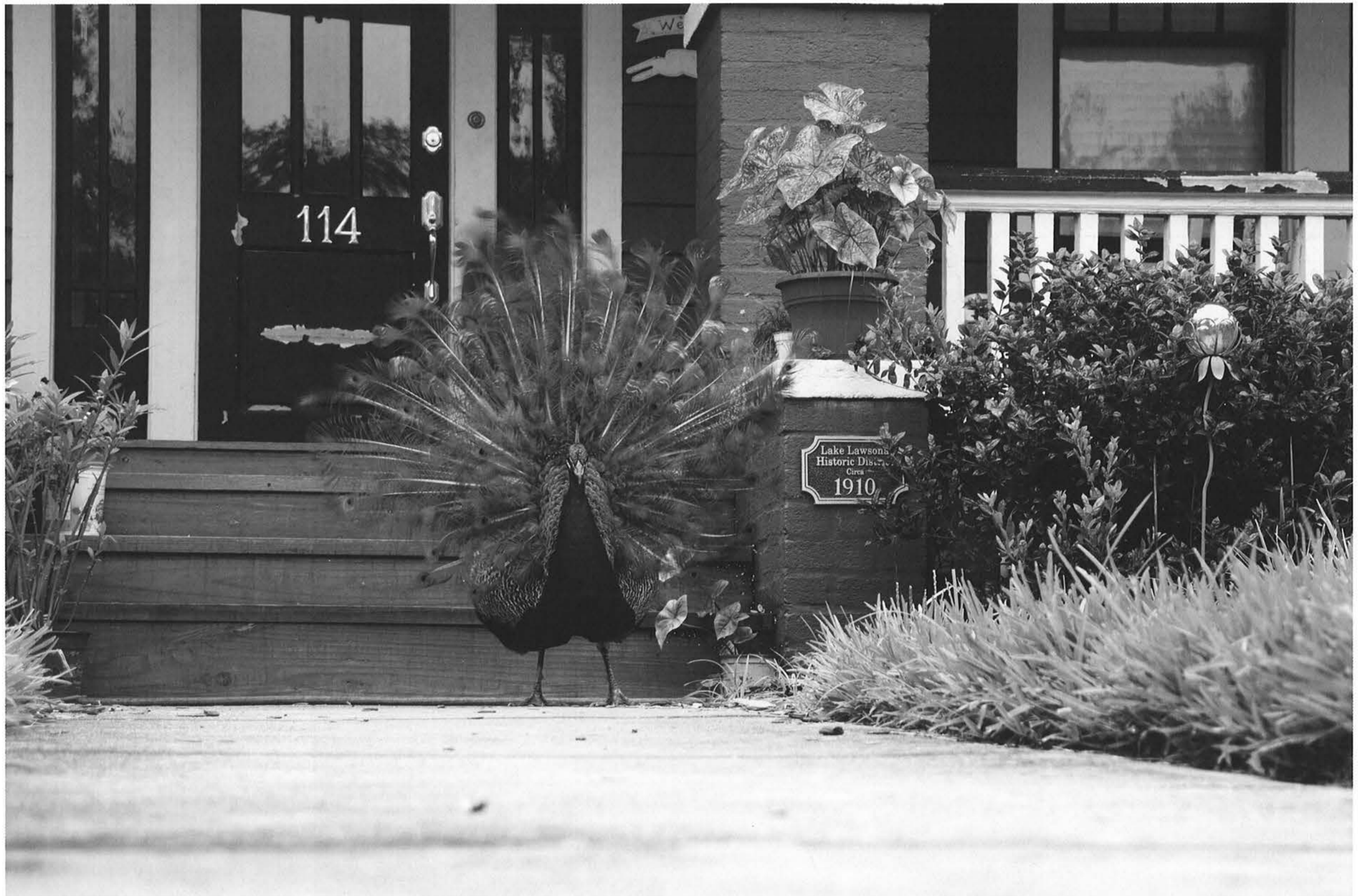
114 South Lawsona Boulevard • Circa 1910 • Photo by Allen Crowder

The two-story wood frame Vernacular house at 114 South Lawsona Boulevard was built in circa 1910.