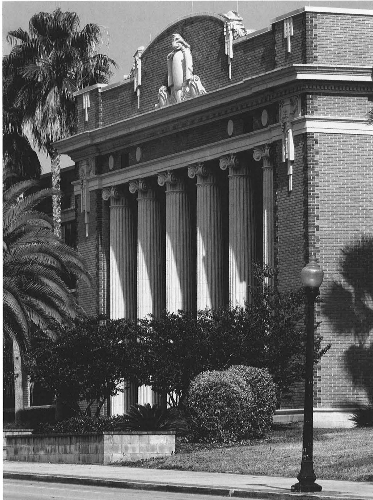
Howard Middle School • 1927

Howard Middle School was built in 1927 as Orlando High School. The building is Greek Revival in style and constructed of blond brick with massive two-story fluted ionic columns.