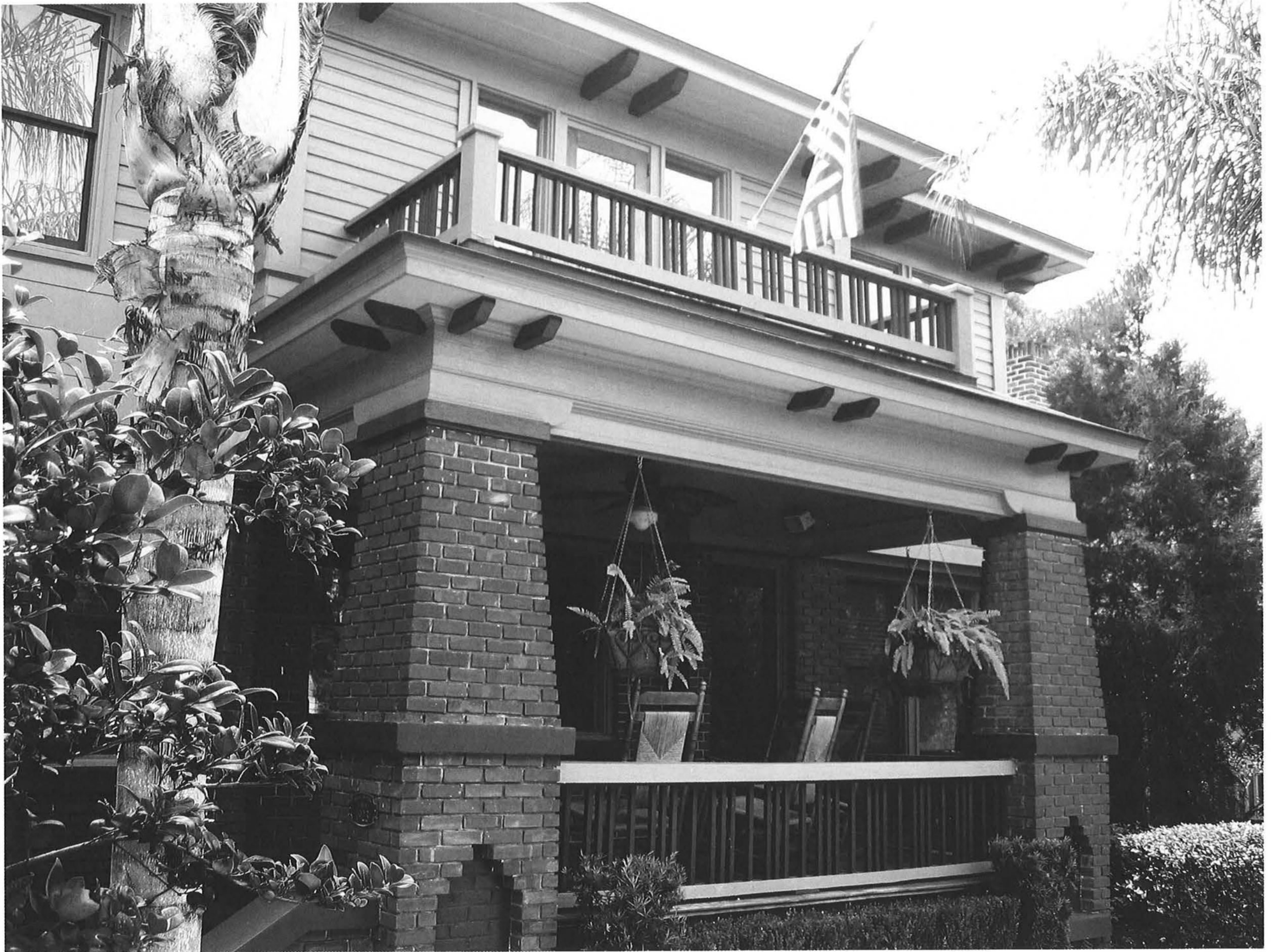
129 James Avenue was built circa 1924 and is a two-story Prairie style residence.