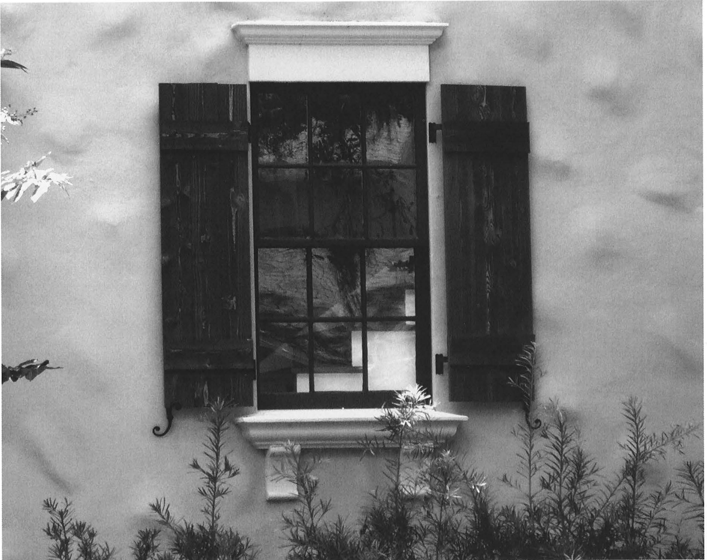
104 South Lawsona Boulevard

Lake Lawsona was known as Lake Hardaman before the area was developed as a subdivision.