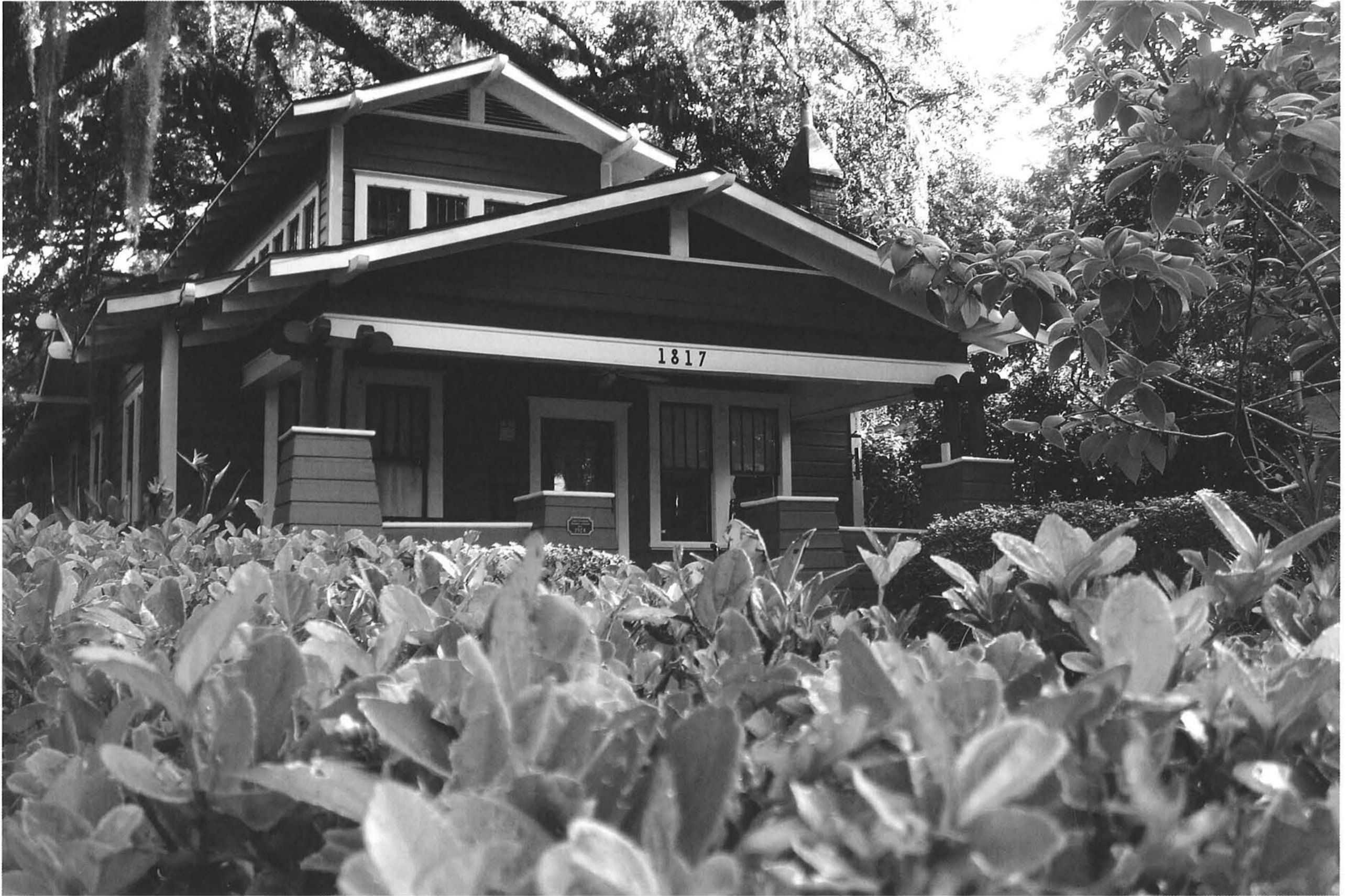
1817 East Washington Street • Circa 1924 • Photo by Katherine Magley

The house at 1817 East Washington Street was built circa 1924 and is a good example of the Japanese influence within the Craftsman Bungalow style.