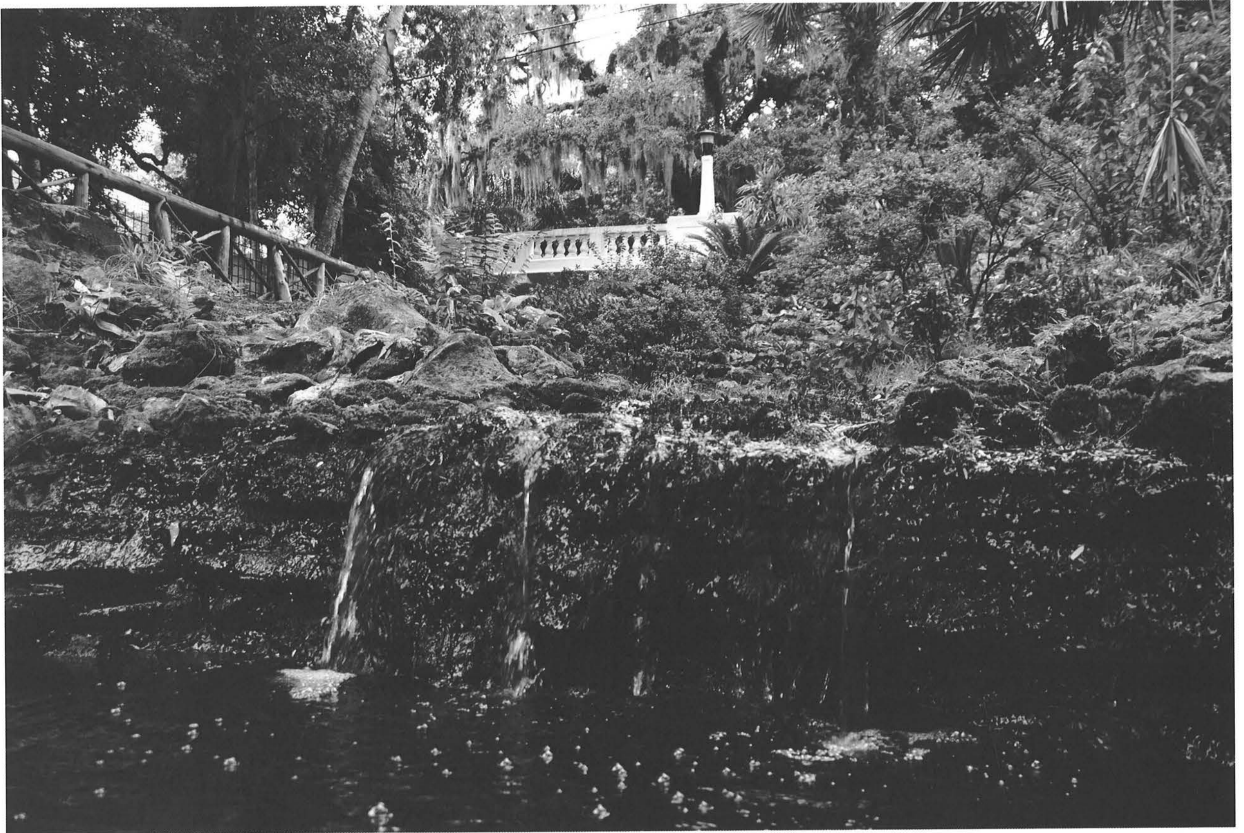
Fern Creek below the Washington Street Bridge, Dickson Azalea Park • 1926

Dickson Azalea Park was designated as an Orlando Landmark in 1991. The concrete bridge was built in 1926 as a replacement for the original wooden bridge.