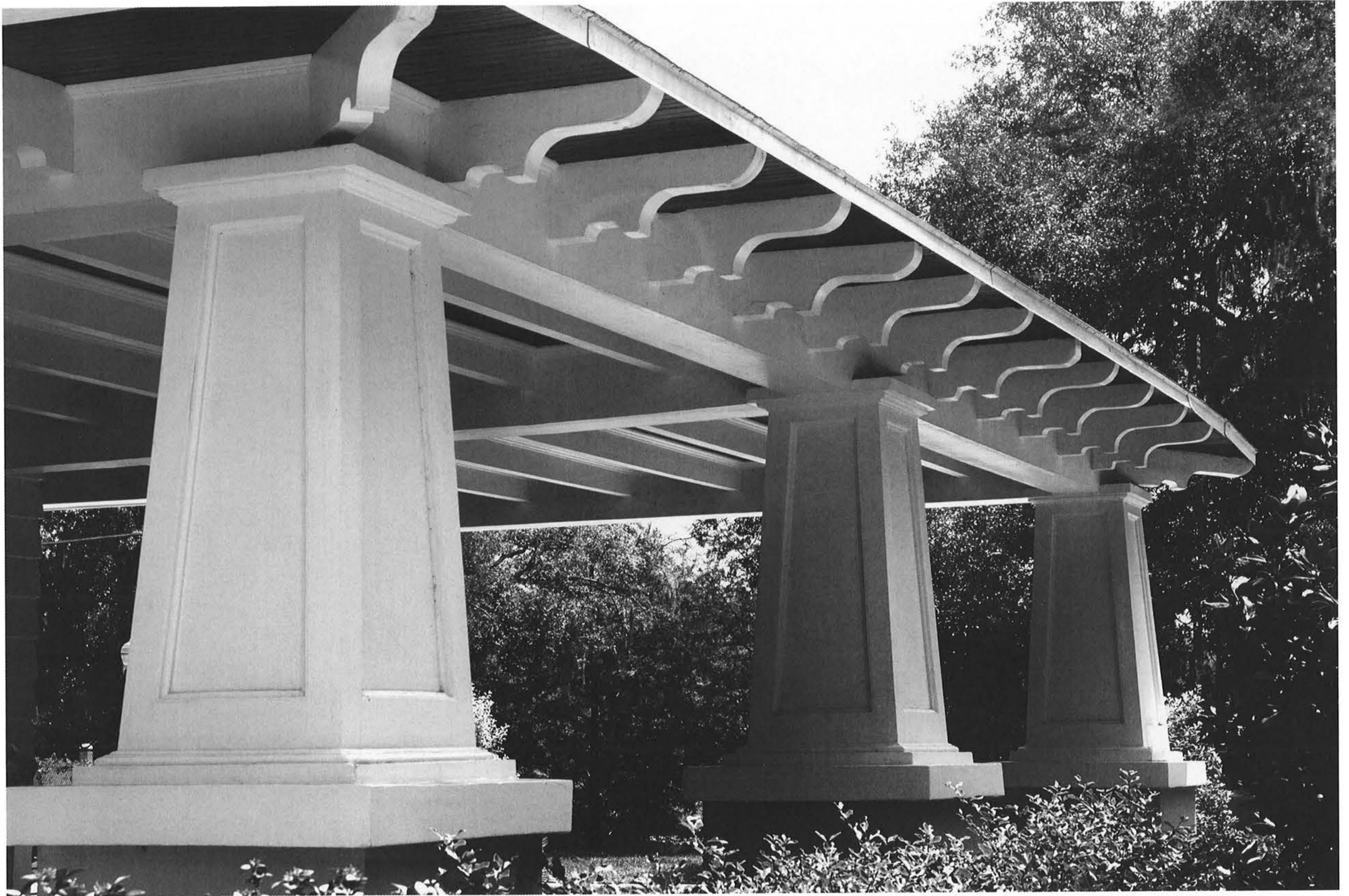
214 South Thornton Avenue • 1926 • Photo by Glenn Green

The two-story wood frame bungalow at 214 South Thornton Avenue was constructed in 1926 at a cost of $3500.00.