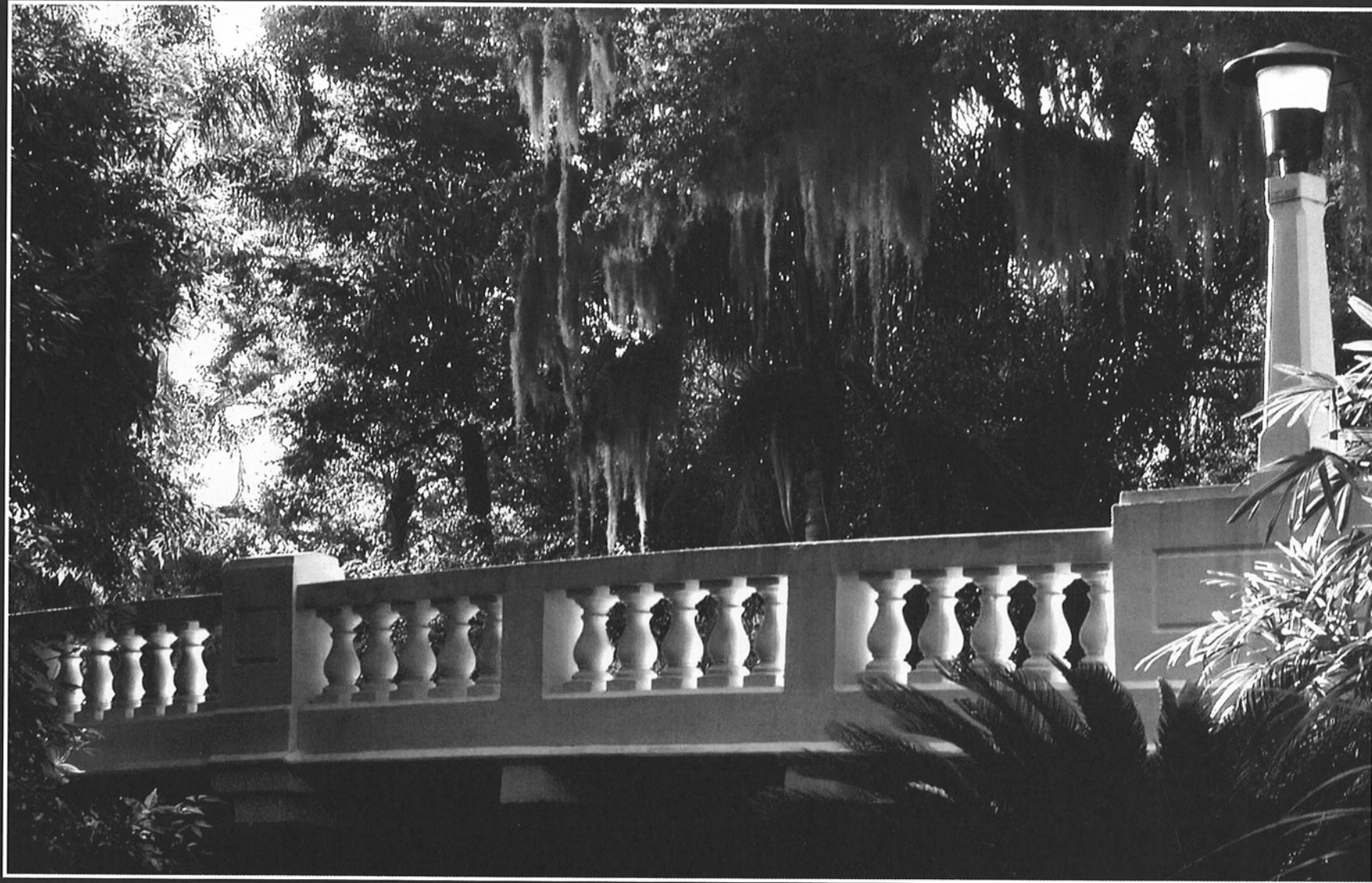
Washington Street Bridge, Dickson Azalea Park

CITY OF ORLANDO ECONOMIC DEVELOPMENT HISTORIC PRESERVATION BOARD