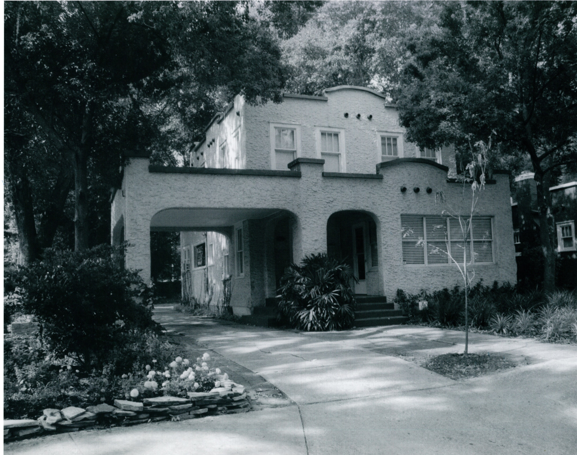
1636 Hillcrest Street · circa 1927