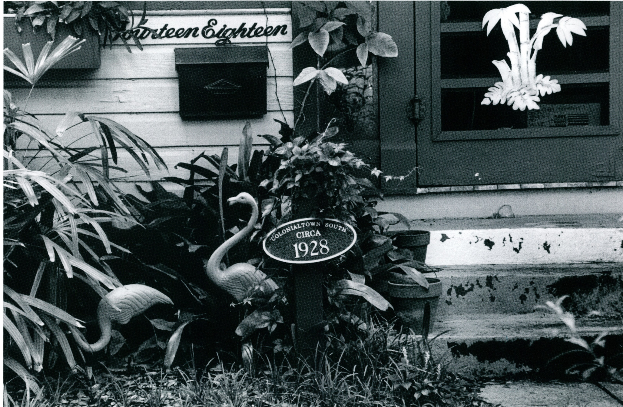
1418 East Livingston Street · circa 1928 · Photograph by Anita Vrionides