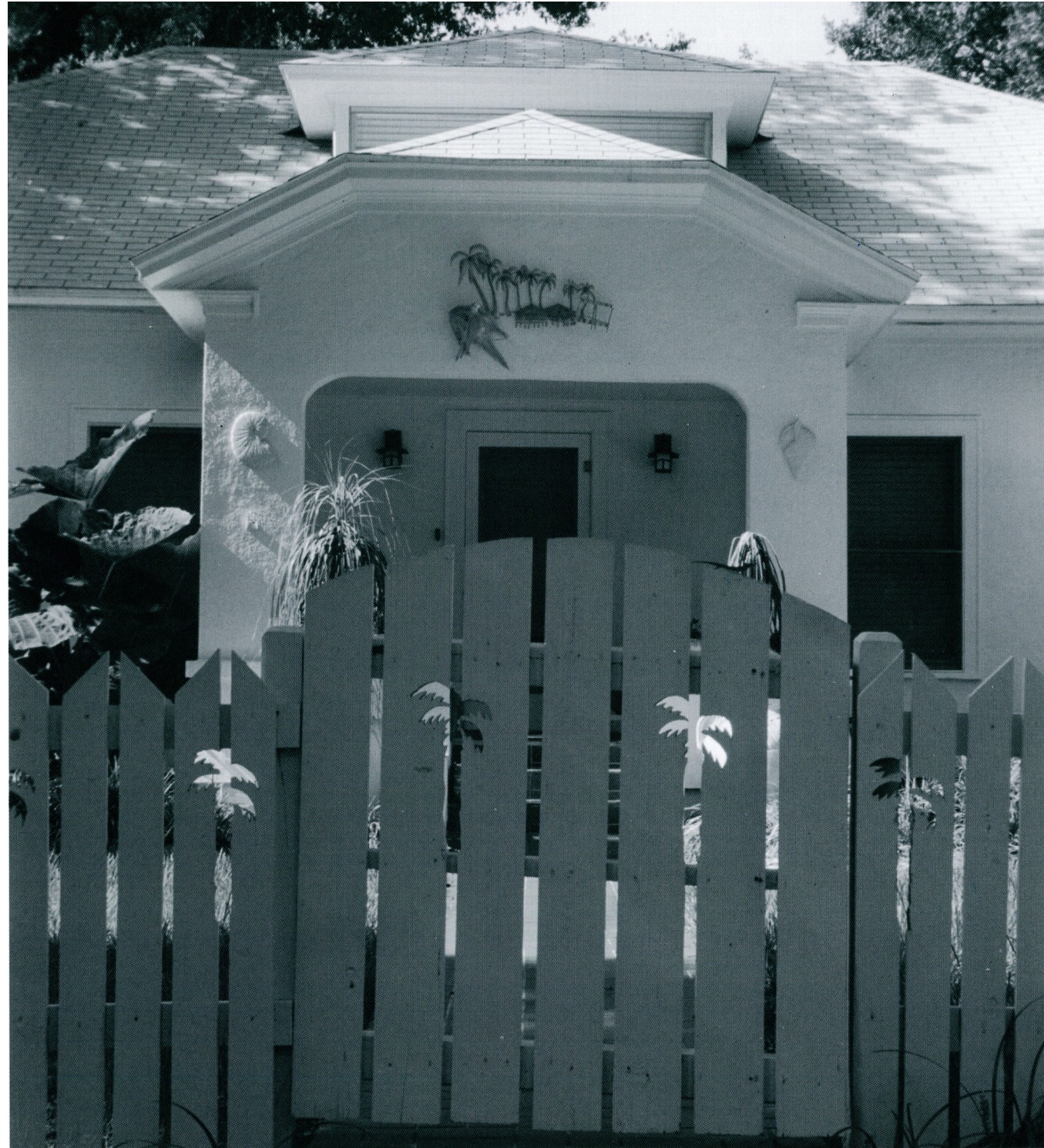
1626 East Concord Street · circa 1925