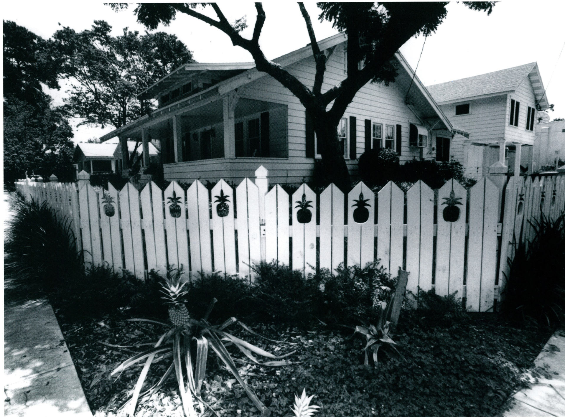
1402 East Livingston Street · 1926