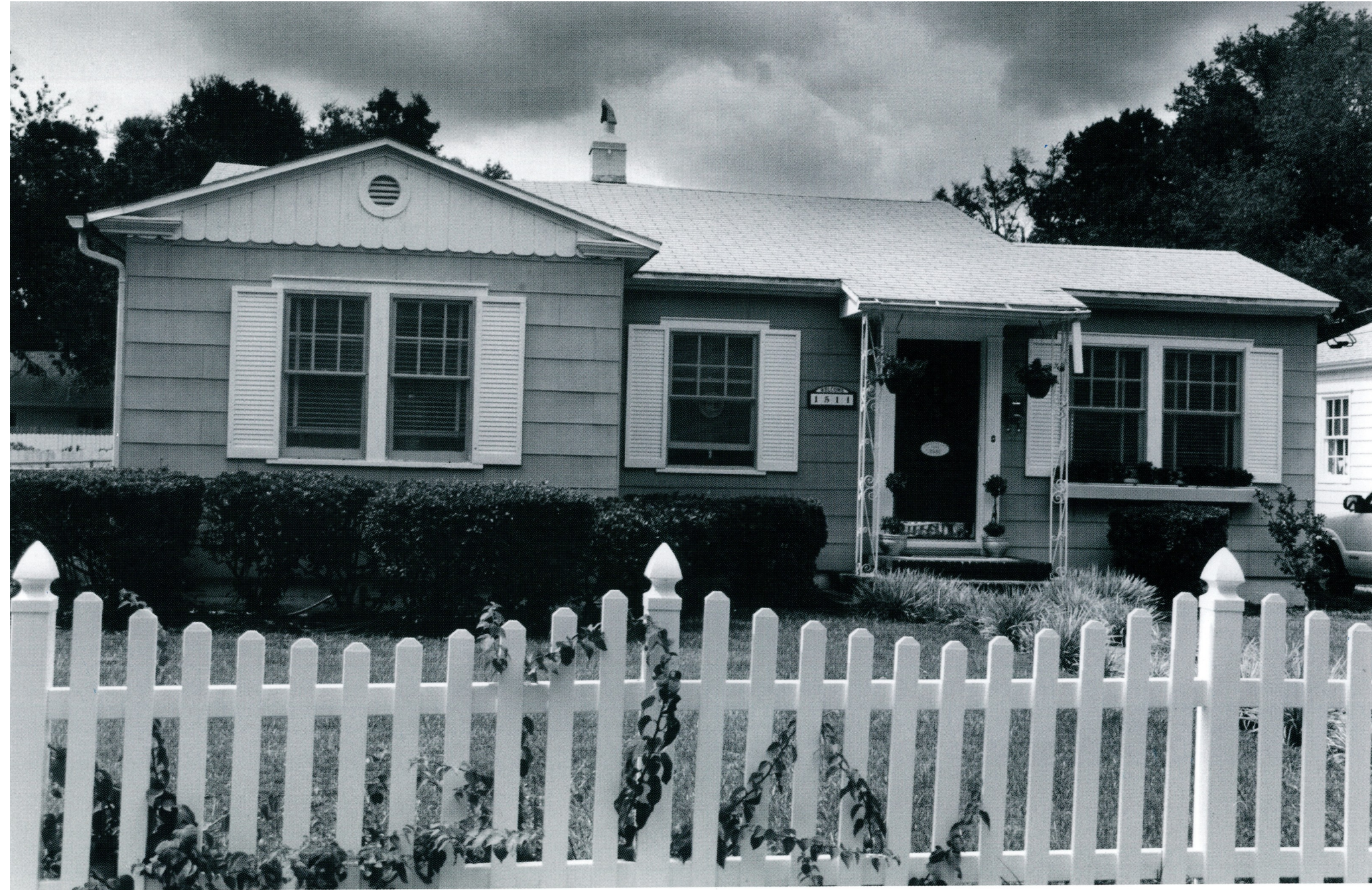
1511 East Livingston Street · 1941