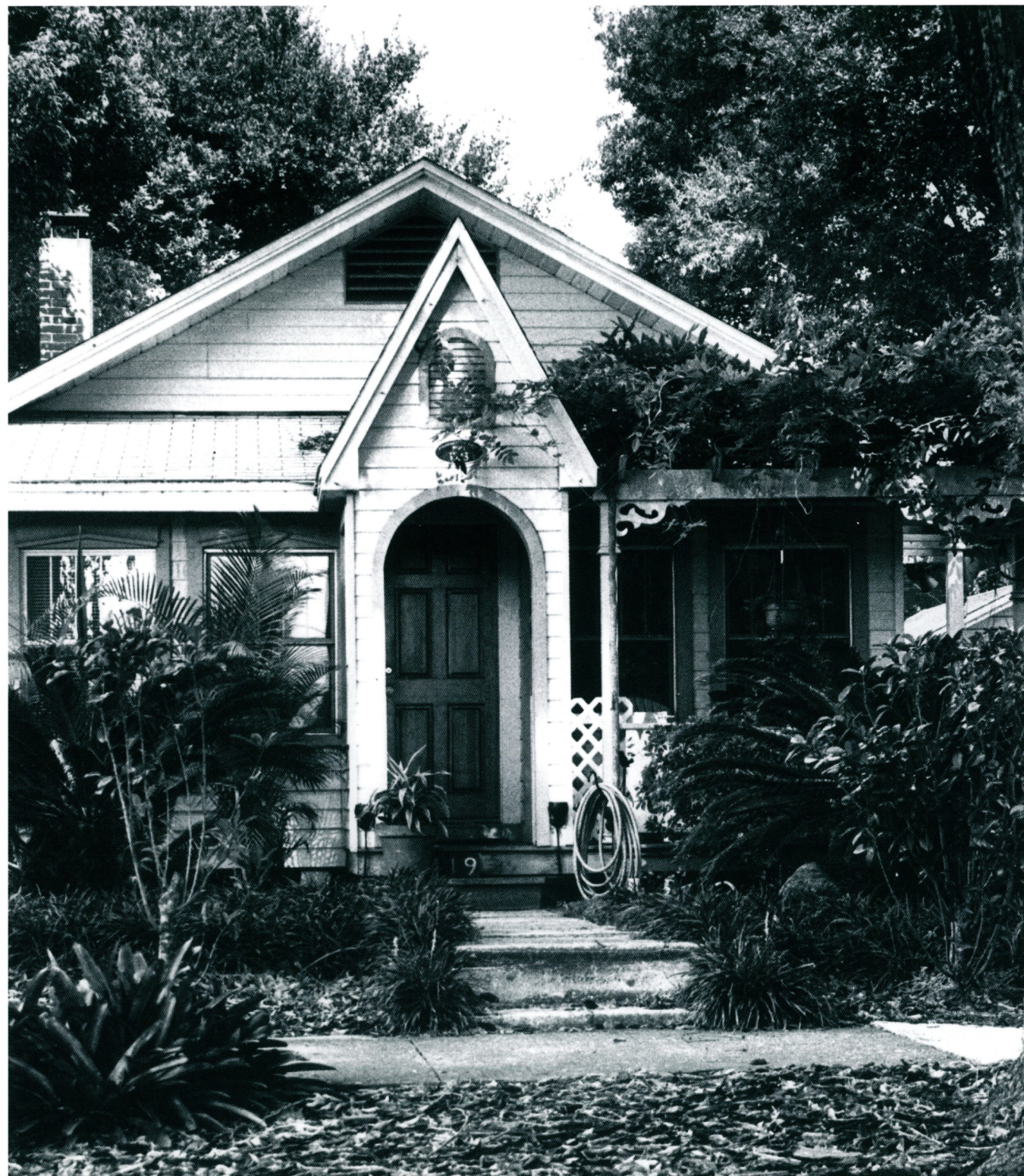
419 Shine Avenue · 1923