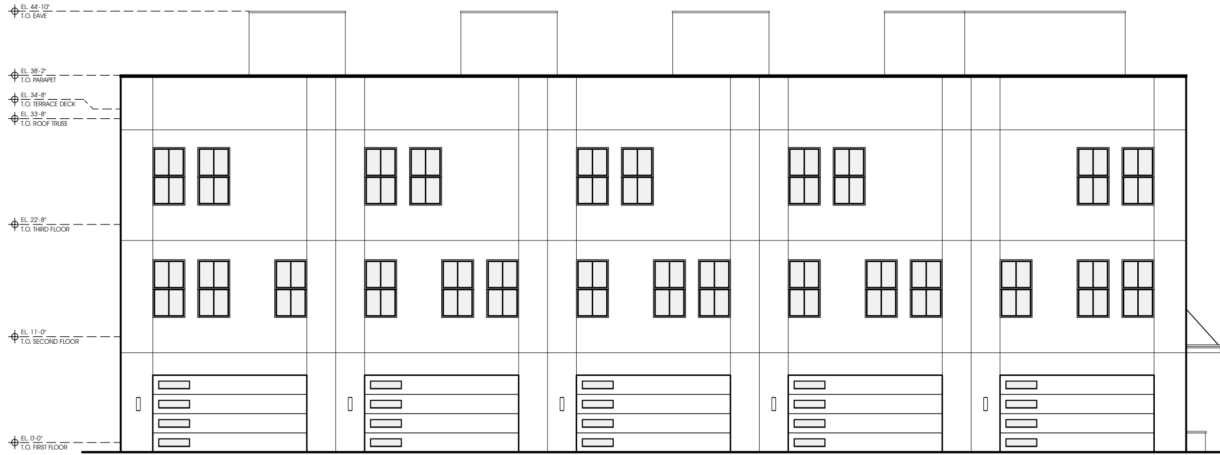
BUILDING I REAR ELEVATION