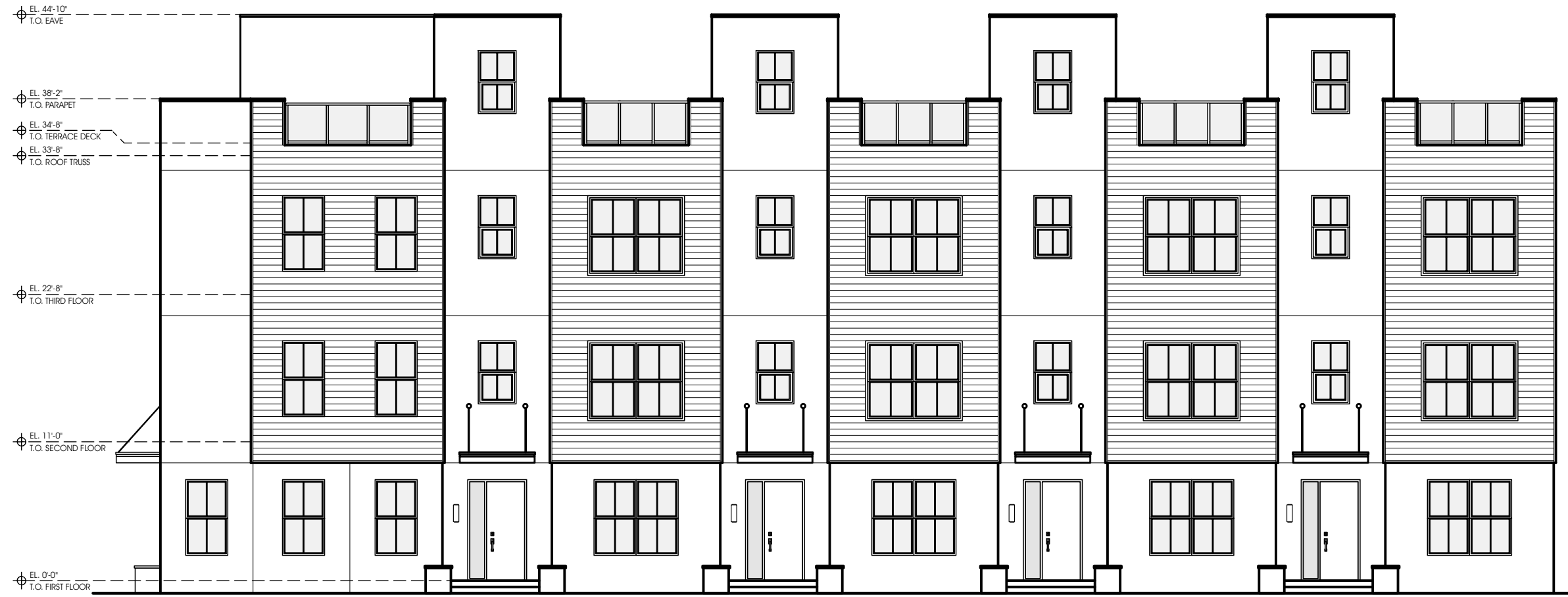
BUILDING I FRONT ELEVATION